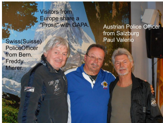
Visitors from Europe share a "Prosit" with GAPA.

happy to be the President of this great organization and its dedicated members. I want to thank the Maifest committee for giving us this opportunity and for the donation that we received in return for our services. Hopefully, we will have an